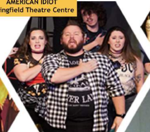
AMERICAN IDIOT Springfield Theatre Centre