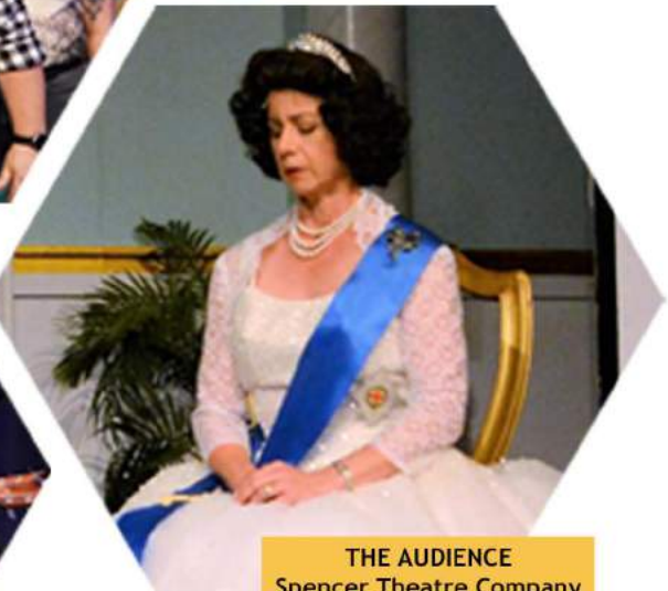
THE AUDIENCE Spencer Theatre Company